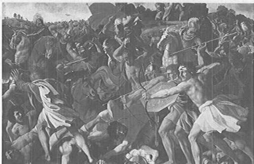
Joshua's Victory over the Amelekites, by Nicolas Poussin.

It was beginning to dawn on me that much biblical