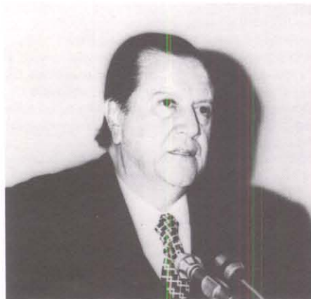
Rafael Caldero, ex-President of Venezuela