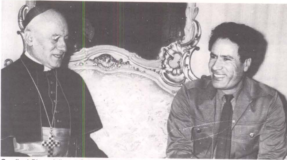
Cardinal Pignedoli and Colonel Ghaddafi