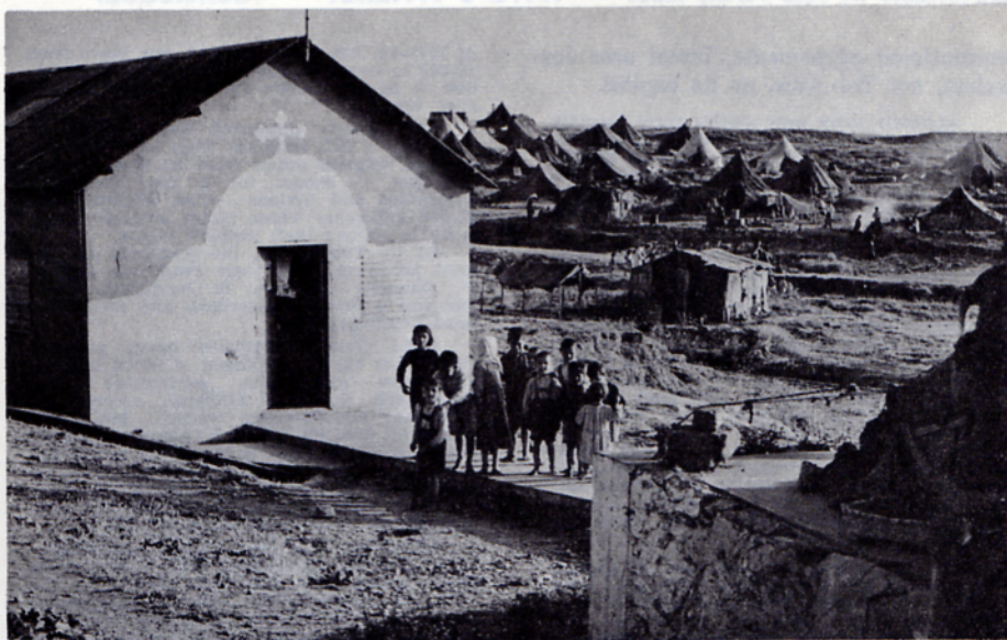
Throughout the centuries refugees have been sustained by, and borne witness to, their faith. Here, in the foothills of Mount Lebanon, Palestinian Christians built a chapel even before replacing tents and shanties with more substantial homes.

Christians. Currently Christians occupy 10 seats, 3 more than the guaranteed minimum. The Senate, appointed by the King, is usually generously sprinkled with Christians, as are the Cabinet, the Foreign Service and the military.