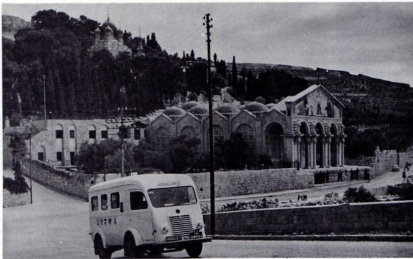
Foreign Christian communities have established churches and charities in the Middle East. Here a U. N. Relief & Works Agency ambulance, speeding refugee patients to Augusta Victoria Hospital (Lutheran) in Jerusalem, passes St. Mary Magdalene Russian Orthodox Church and the Catholic Church of All Nations at the base of the Mount of Olives.

is enough common ground to warrant the papal declaration of October, 1965, that Christianity has closer ties with Islam than with any other religion. Muslims honor the sinless, Virgin-born Jesus as a person more highly than their own climactic Prophet, Mohammed. Though with differences that have sometimes led to tragically violent disputes, both Christianity and Islam also believe in God's personal transcendence and providence, a final judgment, resurrection and eternal life.