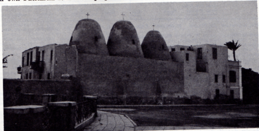
The Virgin Mary Coptic Church of Maadi (Suburban Cairo) has three domes to honor the Trinity.