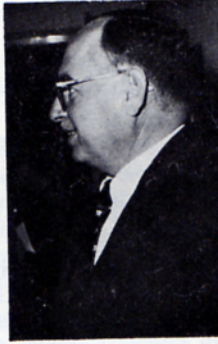
A MELKITE EMBROIDERER, A JACOBITE CANDLE MAKER, A YMCA BASKETBALL PLAYER AND A MARONITE BUSINESSMAN. ALL ARABS. ALL CHRISTIANS.

ship, including the Patriarchs ('most holy Popes').