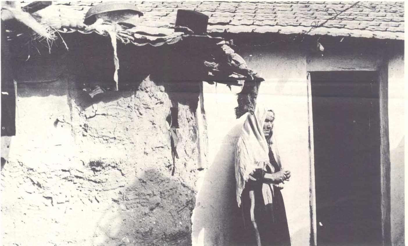
Average accommodation for a refugee family of five is a ten foot square room. In Gaza land is limited, overcrowding inevitable.

"At a meeting in Gaza, on 28 July, at which the Commissioner General expressed his concern and sought more information, the Military Governor of the Gaza Strip said that the operations were limited to Jabalia camp; that the numbers involved would not be out of proportion to the numbers involved in earlier road-widening in other camps (where housing had been provided in advance in the same camp); that there were plans for new housing in the Strip, but action was urgent in view of the killing of 80 persons in a period of five months; that El-Arish was being used