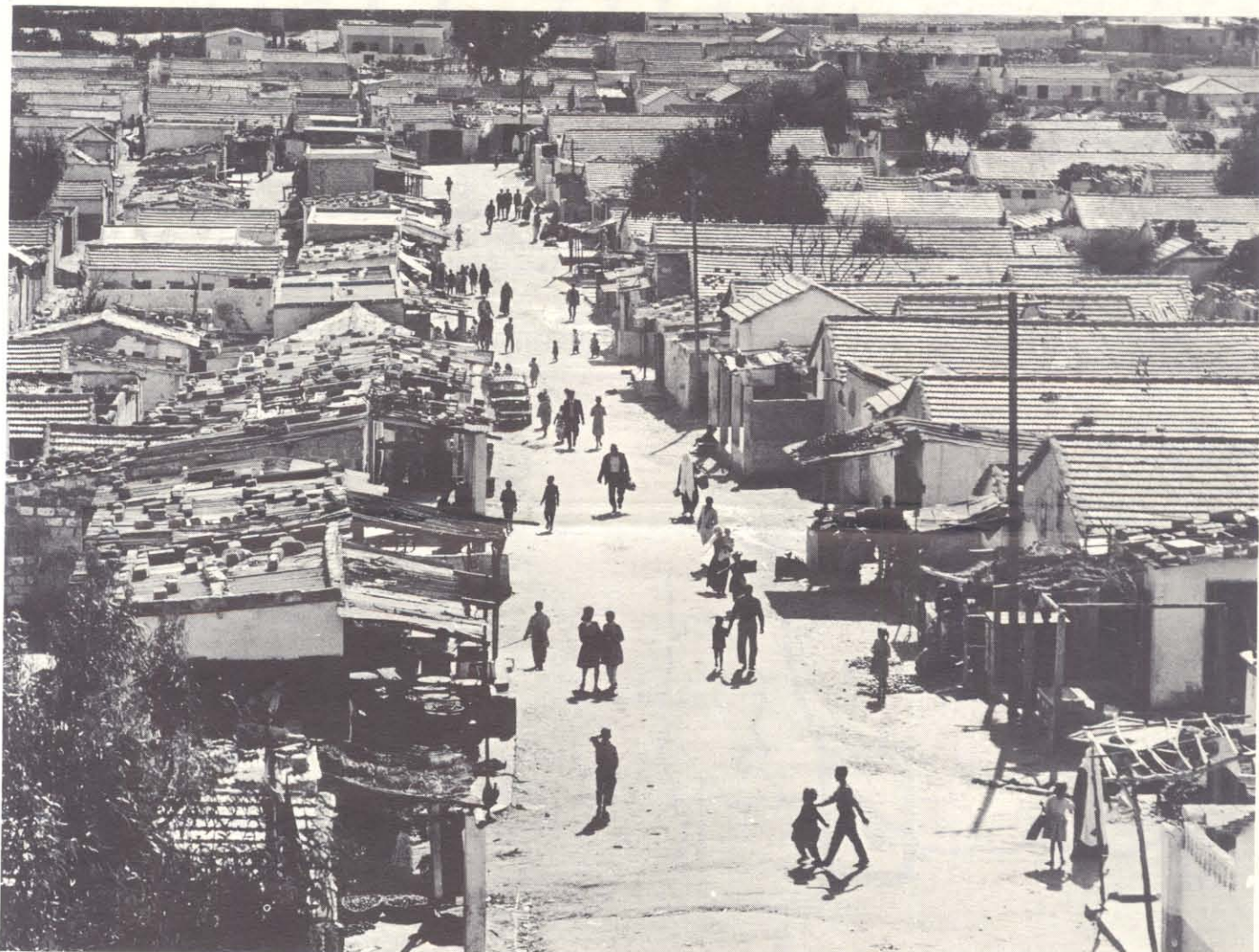
A street scene in UNRWA's Beach Camp in the Gaza Strip, the home of more than 30,000 Palestinian refugees.