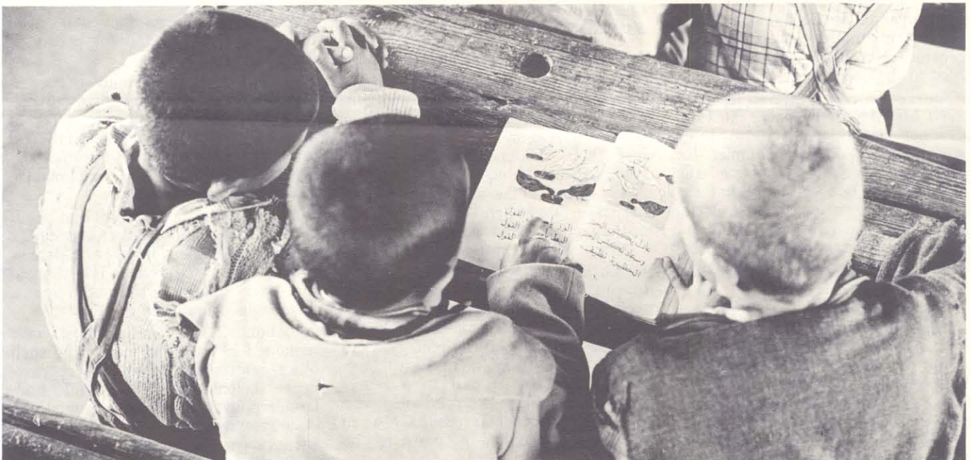
Intent on their studies although there is only one book among the three of them, these Palestinian refugee children attend the elementary school in UNRWA's Beach Camp in the Gaza Strip.

Combined with other preventive measures, UNRWA's environmental sanitation program has kept many serious communicable disease from reaching epidemic proportions among the refugees.