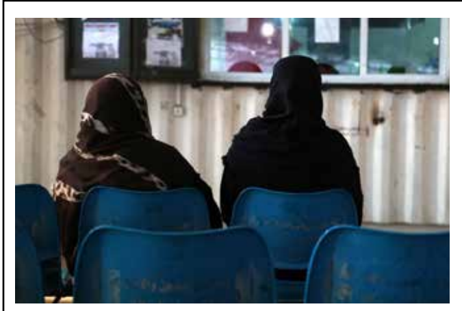
Women waiting to exit Gaza for medical treatment

Accordingly, cancer patients live at the mercy of military permits — be it in terms of when the chemotherapy would be available in Gaza or when the cancer patients themselves are allowed to access other kinds of therapy, e.g. radiotherapy in Jerusalem. Patients have to go outside of Gaza as radiotherapy equipment has been blocked from entering the Strip by the Israeli military for years. Patients can go to either Israel or Egypt for such treatment.