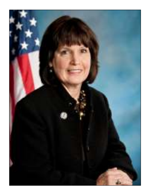
Rep. Betty McCollum, D MN.

So, on June 20, 2016, twenty members of the United States Congress signed a letter to President Barack Obama urging the appointment of a Special Envoy for Palestinian Children