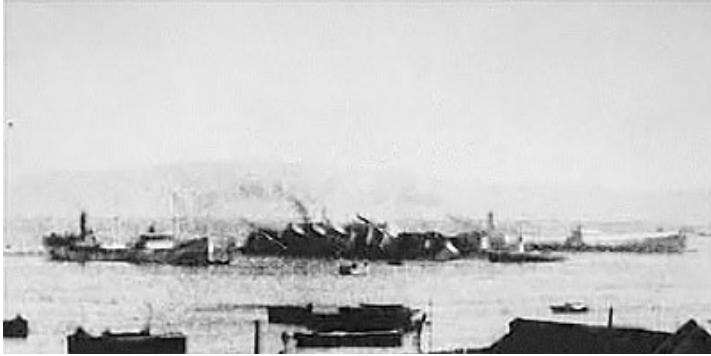
The 1940 bombing of the Patria by the Jewish Agency, 267 killed, 172 injured.

thousands of orphans of Jewish background were forcibly taken from their adoptive families for shipment to Palestine as ethnic fodder, and new Jewish adoptive homes in England for young survivors still in the camps were stopped by the Jewish Agency. By virtue of being Jewish,