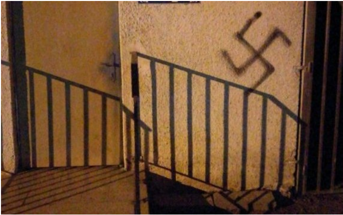
The Times of Israel, June 11, 2017: Police arrest two teenagers on suspicion of daubing swastikas on two synagogues. A police source confirmed the suspects were both Jewish.

tion of a racial-nationalist ideology whose very existence depends upon the preservation of victimhood, isolation, and a never-ending existential threat. This psychosis is Zionism's life support.