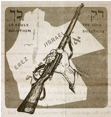
Irgun emblem from The Jewish Struggle , London, 1946

non-violence despite the ever-increasing provocation. "It is noticeable," as the Chief Secretary of Lydda District put it, "that the continuance of Jewish terrorist outrages has