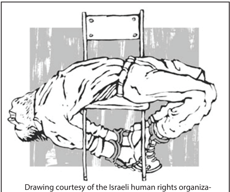
Drawing courtesy of the Israeli human rights organization Beit T'Selem. For more on his practice, see The Link , June-July 2001: "Americans Tortured in Israeli Jails."

They released me in this condition and I found