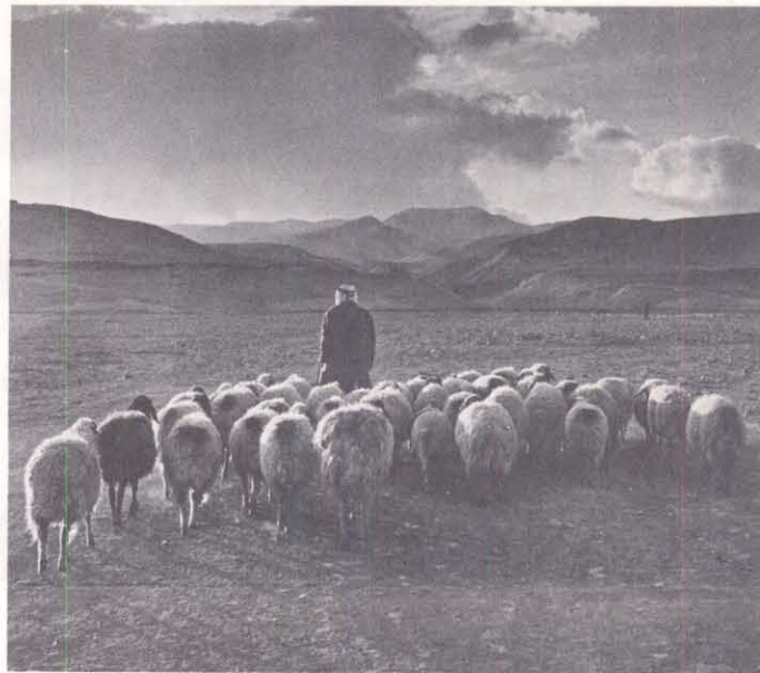
THE 23RD PSALM and the New Testament imagery of the Good Shepherd gain new significance after watching a Palestinian herdsman's care for his sheep.

The pastors of North America, anxious to make the