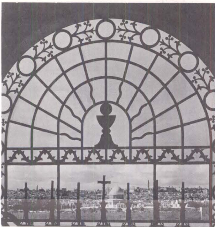
STAINED GLASS IS UNNECESSARY in the Dominus Flevit Church on The Mount of Olives. Looking across its altar one may gaze out upon the Holy City of three faiths as a reality, not just a picture.

especially in its overriding disregard for the people of the land, whose home it has been for centuries. Such callousness in Holy Land zealotry must be diligently resisted.