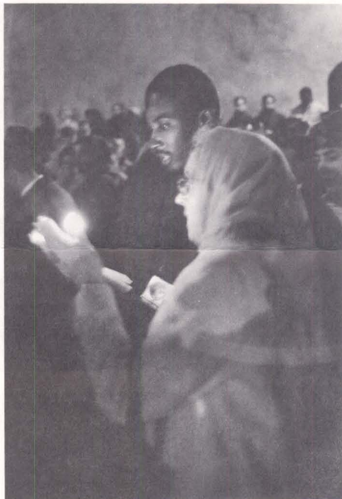
PILGRIMS FROM AFRICA, EUROPE and other continents may join local Arab Christians at worship in Bethlehem.