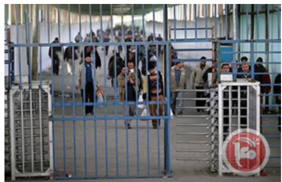
Palestinian workers being processed...