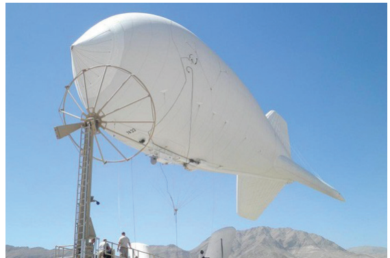
While an observation balloon looms above.