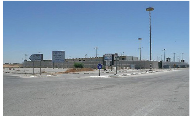
Erez Industrial Park ... with walls and watchtowers.

The breakdown of Oslo and the eruption in 2000 of a renewed Palestinian uprising – the second intifada – posed problems both to Erez and to the plan for more industrial zones. In 2004, as the intifada intensified, Erez was closed. Hopes for the industrial zones went into similar abeyance.