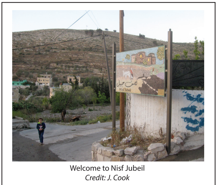
Welcome to Nisf Jubeil