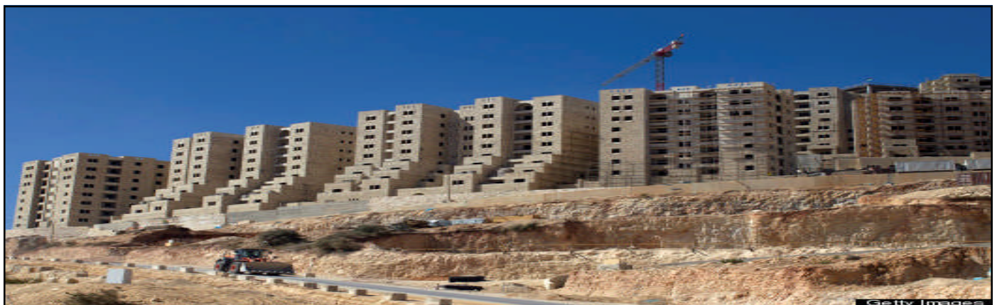
Above source: Central Bureau of Statistics, Monthly Construction Bulletin; Report on Israeli Settlements in the Occupied Territories, v. 24, #2. Below: West Bank settlement, Getty Images, huffingtonpost.co.uk