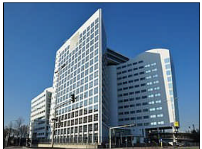
International Criminal Court, The Hague