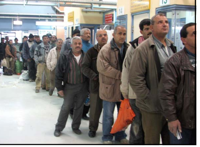
Palestinians wait to show their IDs and be searched at Einab terminal on

I knew it would be a while, so I sat down again. I thought I was past the point of anger until I noticed a line of 25 or so Palestinians waiting outside to come in from the other direction, heading back to Tulkarem. Had they been waiting there all this time? Why weren't they being processed? I asked the guard holding my passport and he said he'd tend to them after I left.