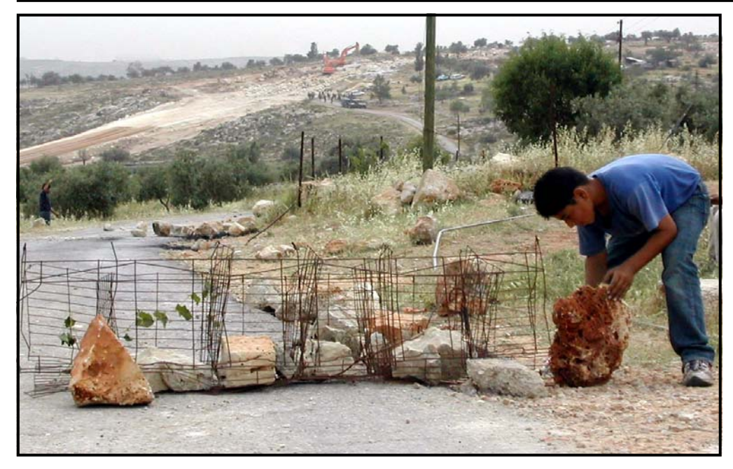
Non-violent resistance takes many forms. Here, a Palestinian boy builds a roadblock with rocks and wire hoping to deter the Israeli army from invading his village during the night.

any suicide bomber ever could. The more insufferable daily life in Palestine becomes, the more Palestinians will leave "voluntarily," and the fewer non-Jews will be left in Israel and the lands it occupies and gradually annexes with the Wall.