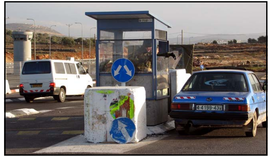
Zatara checkpoint was redesigned to provide separate lanes for Jewish settlers (left lane, yellow-plated cars) and non-Jews (right, white– and green-plated cars.

item separately into the crates. The papers from my notebook were strewn about loosely. Each piece of embroidery had been removed from its protective wrapper and crumpled into a pile. A can of tuna had been opened and amidst left the hand-sewn garments. Even the boxes of Turkish delight – a soft sticky candy cov-