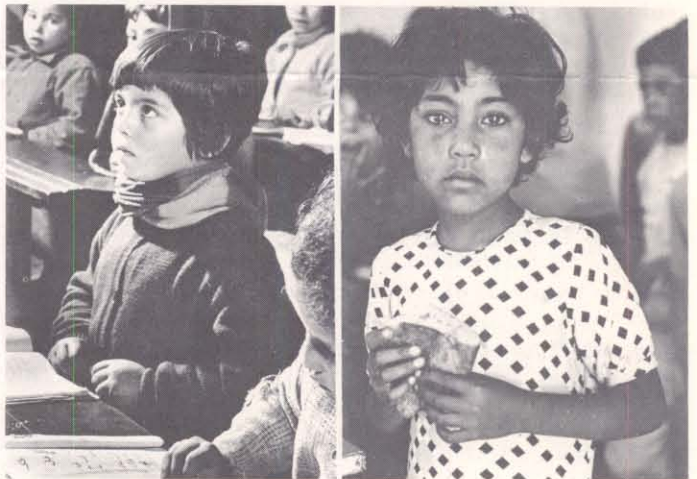
Wide-eyed little Palestinian refugee girl, above left, attends one of UNRWA's smallest schools, located in the Old City of Jerusalem. And in a temporary shelter in Amman, Jordan, another receives her daily bread. Both are beneficiaries of the Pontifical Mission for Palestine.