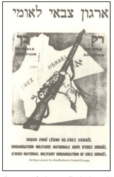
Poster of Irgun Zvai Leumi. Shows territorial aims for "Erez Jisrael," Greater Israel, on both sides of the Jordan, and their intention to seize it through force.