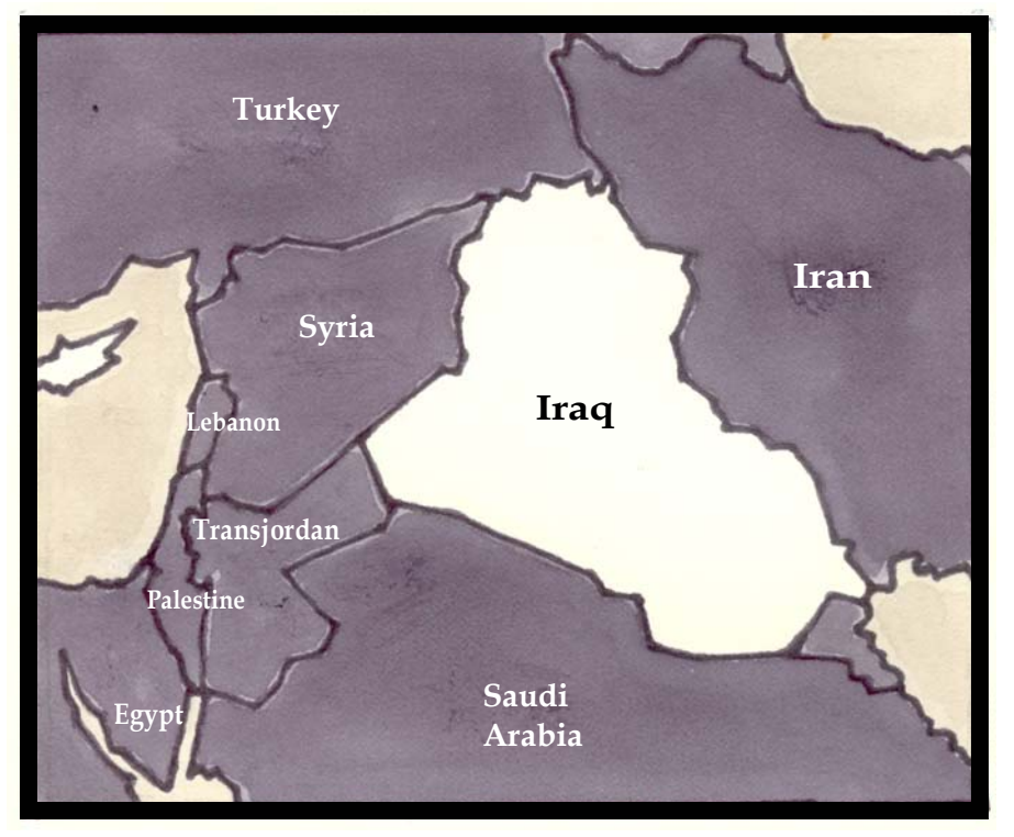
Lines in the sand: The Middle East 1935

Throughout the period of the Iraqi monarchy -- a span of less than three decades -- a constant reshuffling of ministers produced 59 cabinets averaging only eight months each. On July 14, 1958, this period of turmoil ended when 200 "Free Offi-