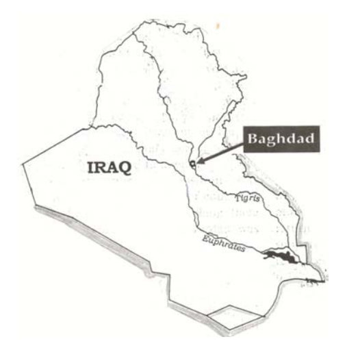
The land between the rivers

Situated on the west bank of the Tigris, Baghdad was to emerge as the most splendid metropolis of the time and became known as the Round City or the City of Peace. Its diameter was some two miles, with three concentric walls, each with four gates controlling the highways that radiated from the ca-