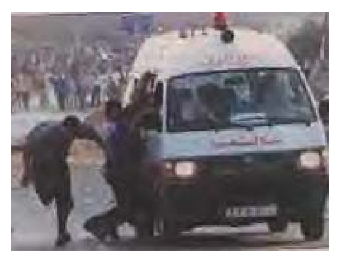
Palestinian ambulance under fire. For this and other photos of violence against Palestinian civilians, see the web site: www.addameer.org