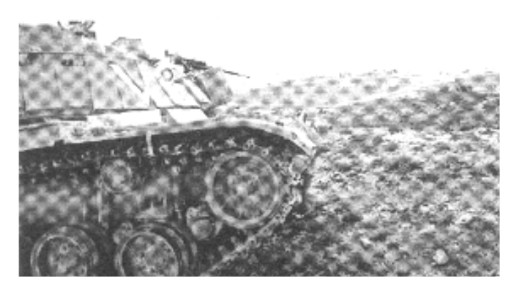
Israeli tank pointing at Beit Jala.

cans often speculate that, were the situation reversed, how different the coverage would have been. Imagine that a Jewish population has been suffering for 50 years under a Arab military occupation; imagine that Arab settlers were colonizing more and more Jewish land; that at some point the Jews rise up in protest; that the Arab occupiers come into their overpopulated cities and camps with tanks and gunships; that a Jewish child stands valiantly