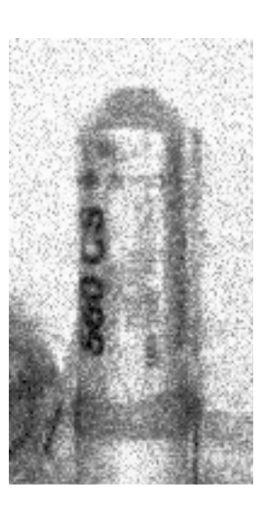
For further information on Israel's use of CS tear gas, see the Palestine Red Crescent Society's web site: www.palestinercs.org/teargas

The "smoking gun" that confirms Israel's chemical and biological operations showed up on 4 October 1992, at 6:35 p.m., when Israel's El Al Flight LY 1862 crashed into a block of 12-story tenements in Bijlmer, just outside Am-