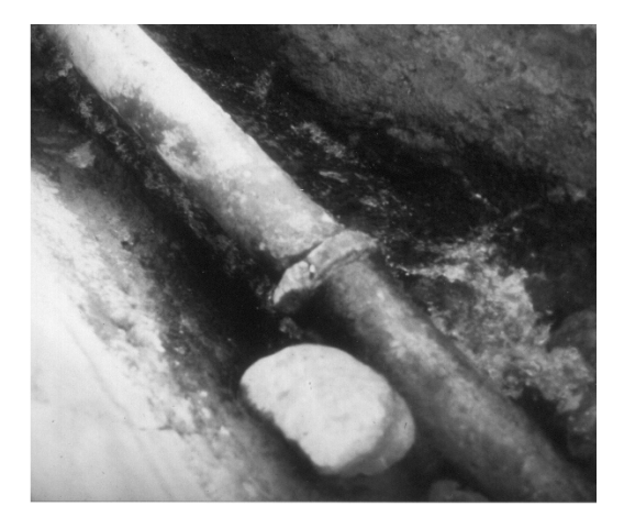
FARMER'S WELL WITH OPEN, ABOVE GROUND PIPES

HOME OF THE PALESTINIAN FARMER WE VISITED