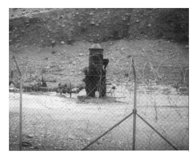
ISRAELI WELL WITH PROTECTED, CONCRETE CASING