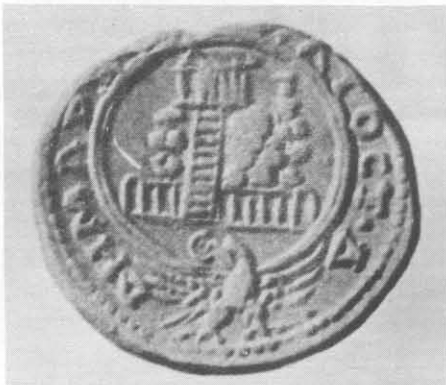
Hilltop temple of Hadrian on Nablus coin. Story at right.