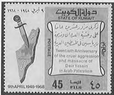
Kuwait stamp issued in 1968 to commemorate the 20th anniversary of the Deir Yassin massacre.

Acknowledging the violation of Palestinian rights is a prerequisite of a morally acceptable Jewish nationalism. The duty to acknowledge and make restitution also suggests the kind of practical measures Israel should take in the current