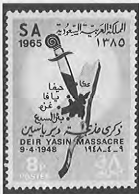
Deir Yassin commemorative stamp issued by Saudi Arabia in 1965.

damage the colleges' reputation when the argument was aired in The Chronicle of Higher Education or the local press.