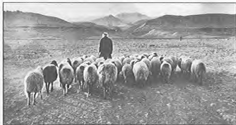
Shepherds Field - Near Bethlehem