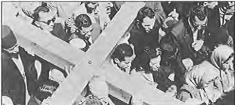
Good Friday Procession. Young Christian Arabs bear heavy cross along Jerusalem's Via Dolorosa.

"All that land you see, for miles and miles, with its housing complexes — it's all confiscated land. The Israelis made this part of a string of settlements that wind their way around every dimension of Jerusalem. This was Beit Jala, it was mostly Christian. But the Palestinians who owned this land, they will never get their land back, they will never regain their property. Here the Israelis have built the biggest shopping