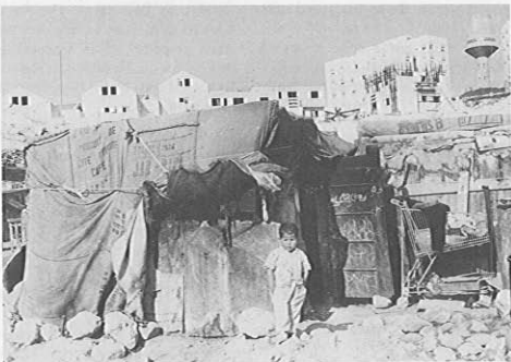
Palestinians evicted in order to expand Jewish settlement of Ma'ale Adumin, December 21, 1993.

The regional Jerusalem plan for the West Bank area around East Jerusalem (which is excluded from the plan) is one example of the