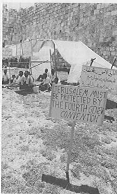
East Jerusalem Palestinians protest Israeli eviction practices, July 1993.

in the Gaza Strip to Israel. This de facto annexation of the settlement lands to Israel is the consequence of all residents of the settlements being explicitly under Israeli law, instead of the law of the occupied territories.