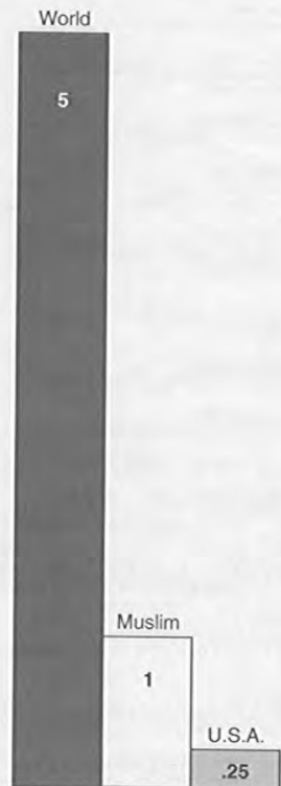
Approx. 1993 Population Figures (in Billions)