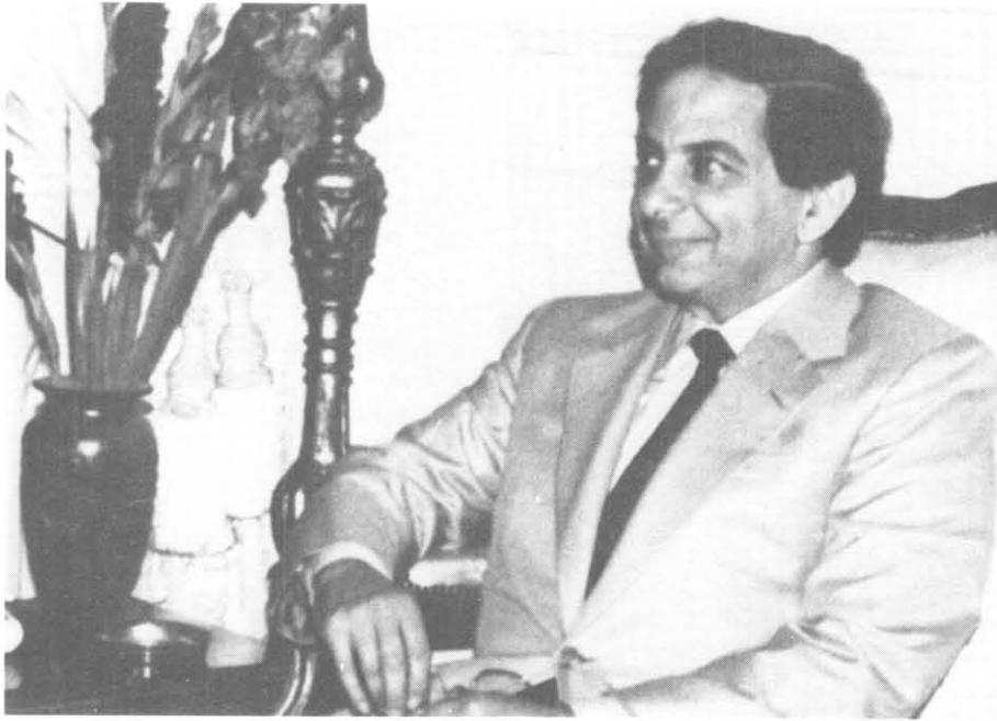
Abraham Sofaer, U.S. State Department legal adviser

In addition to the benefits, Israel was glad to have the 1983 agreement itself. Strategic cooperation "essentially meant that the United States had abandoned the Carter Administration's pursuit of a solution to the Palestinian problem, for a more aggressive, global policy." 49 The quasi-alliance with the U.S. projected an image of power to Arab governments. It also underscored Israel's identity as a "strategic asset," a welcome alternative to its image as a big taker of U.S. foreign aid.