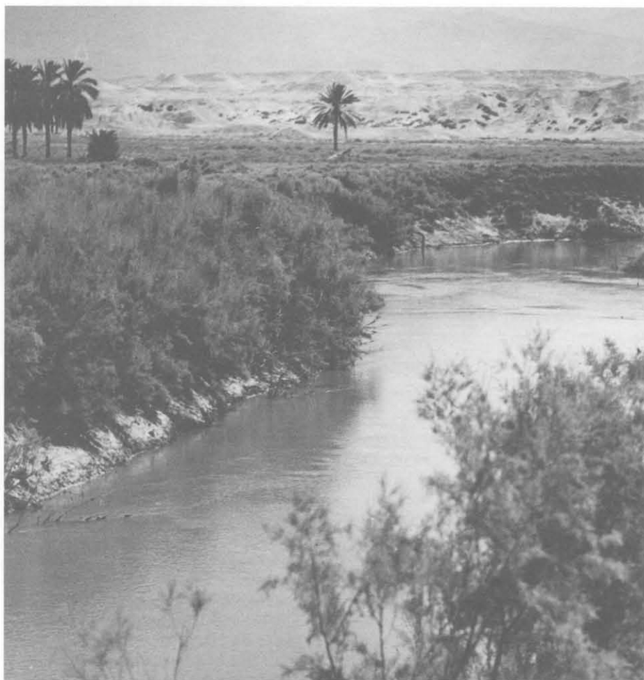
The political distinction between the Jordan River's East and West Banks is centuries old.