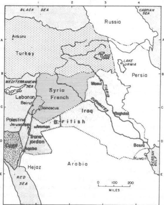
THE SAN REMO AGREEMENT