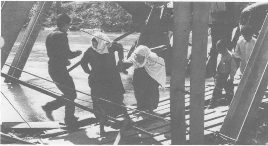
Although waves of Palestinian refugees crossed the Allenby Bridge over the Jordan River in 1948 and 1967, equal numbers of Palestinians remain on the occupied West Bank and Gaza.

Article 2 of this treaty provided that the powers of legislation and administration entrusted to Great Britain by the Mandate would thereafter be exercised in Transjordan by Amir Abdullah. While the League of Nations Mandates Commission considered this agreement incompatible with the stipulation in Article 1 of the Mandate, which provided that Great Britain should have full legislative and administrative powers, the Council of the League reversed the Commission's decision and found the treaty to be in conformity with the Mandate. The Organic Law established a hereditary monarchy with an elected Legislative Council and an appointed Council of Ministers to replace the previous executive council.