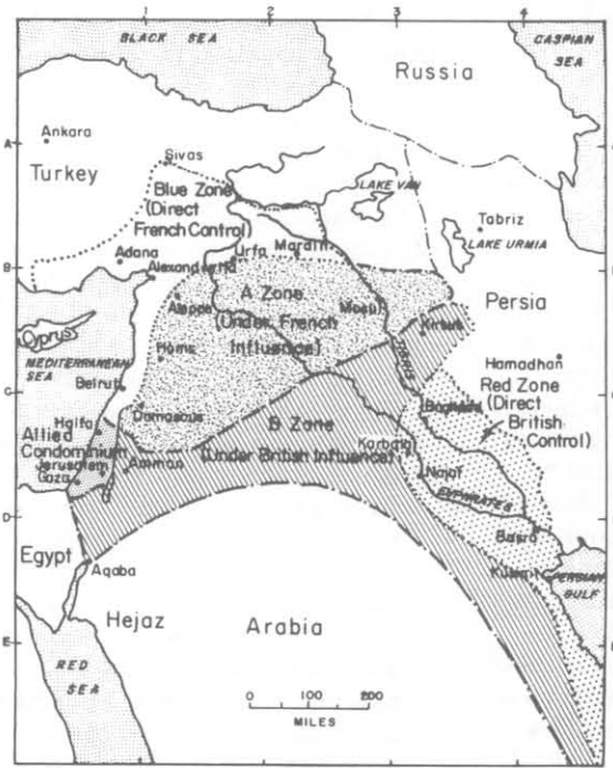
THE SYKES-PICOT AGREEMENT - 1916

The Anglo-Transjordan treaty was signed in Jerusalem on February 22, 1928, and an Organic Law of Transjordan came into force pending ratification, which followed in October 1929.