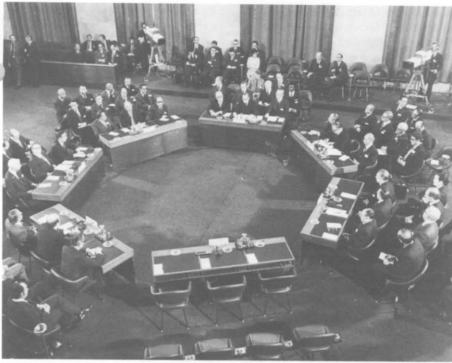
Cooperative efforts by the Soviet Union and the United States brought about a Middle East Peace Conference, held in Geneva to consider disengagement of forces in the 1973 round of the Arab-Israeli conflict.

vocating that the Palestinian Arabs be cleared out of the country. In a letter to his son, Chaim Weizmann said that the Palestinians were like “the rocks of Judea” in the way of the Zionist project and “as obstacles that had to be cleared on a difficult path.” 11