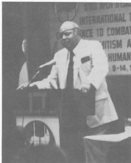
James Farmer took up human rights violations against American blacks in the 1960's.