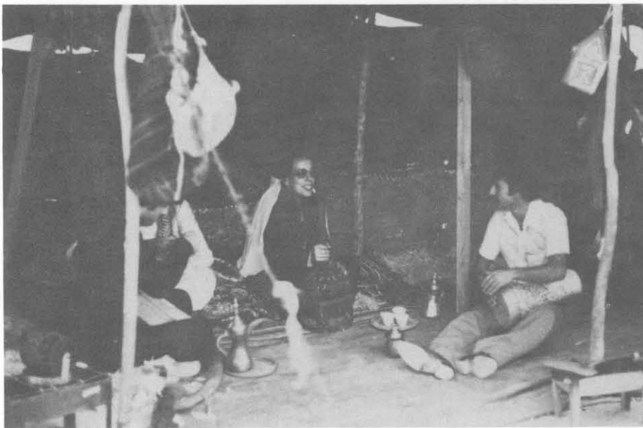
Festive music in Bedouin tent just before Bethlehem University was shut down

the Israeli military government in July 1980. The charges against her were never stipulated, yet this amazing woman has functioned under "town arrest," which restricts her movements to her home, the society and close environs.