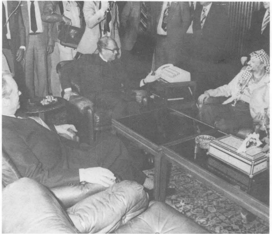
Vienna, 1979: P.L.O. leader Yassir Arafat met with Dr. Bruno Kreisky, Austrian Chancellor, and with Willy Brandt, former West German Chancellor.

An E.E.C. publication, issued after the meeting, assessed the E.A.D. as a permanent reality adding a global dimension to E.E.C. relations with the Arab World. The report placed the E.A.D. in the context of already existing trade agreements, such as the Lome Convention (February 1975) which included the North African Arab states in an E.E.C.-Africa preferential