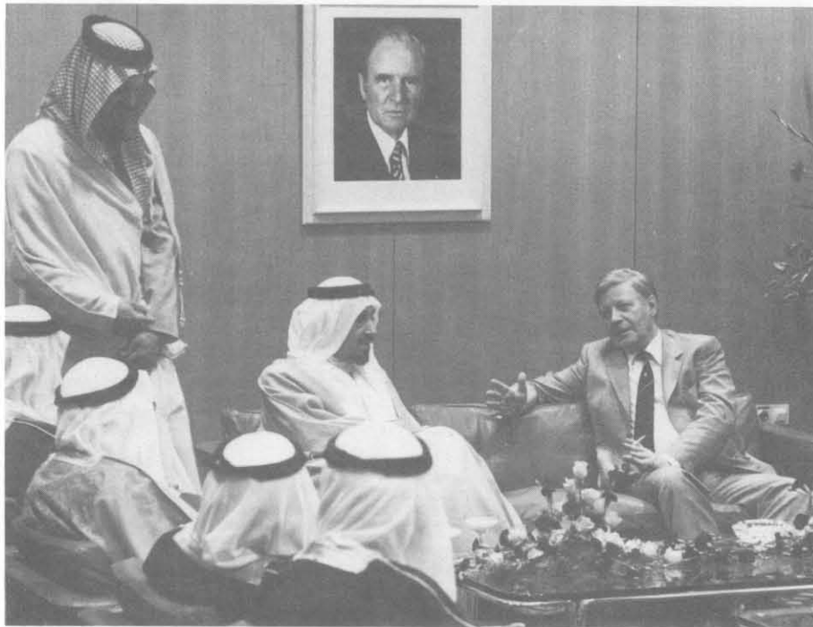
During a state visit to Germany last June, King Khalid of Saudi Arabia conferred with heads of government and agreed to intensify economic cooperation.

The Arabs wanted region-to-region agreements while the Europeans continued to push for E.E.C. agreements with Arab countries individually, on the grounds that the E.E.C. should not provide trade benefits to the oil producers, who had such a large trade advantage over their European customers. The Arabs opposed these arrangements