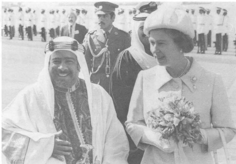
During a three-week tour of the Middle East in 1979, Queen Elizabeth of England talked with Sheik Isa Bin Sulman Al-Khalifa, the Emir of Bahrain.

Problems on the Arab side were of similar magnitude. The Arab League, founded in 1945, is a looser structure