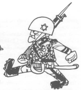
Israel as "Militarist"