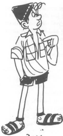
Josh TEL-AVIV 1970