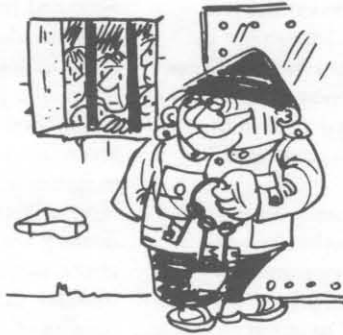
Israel as "Oppressor"