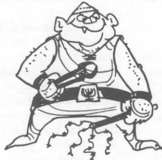
Israel as "Brute"