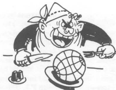
Israel as "Expansionist"