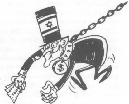
Israel as "Reactionary"