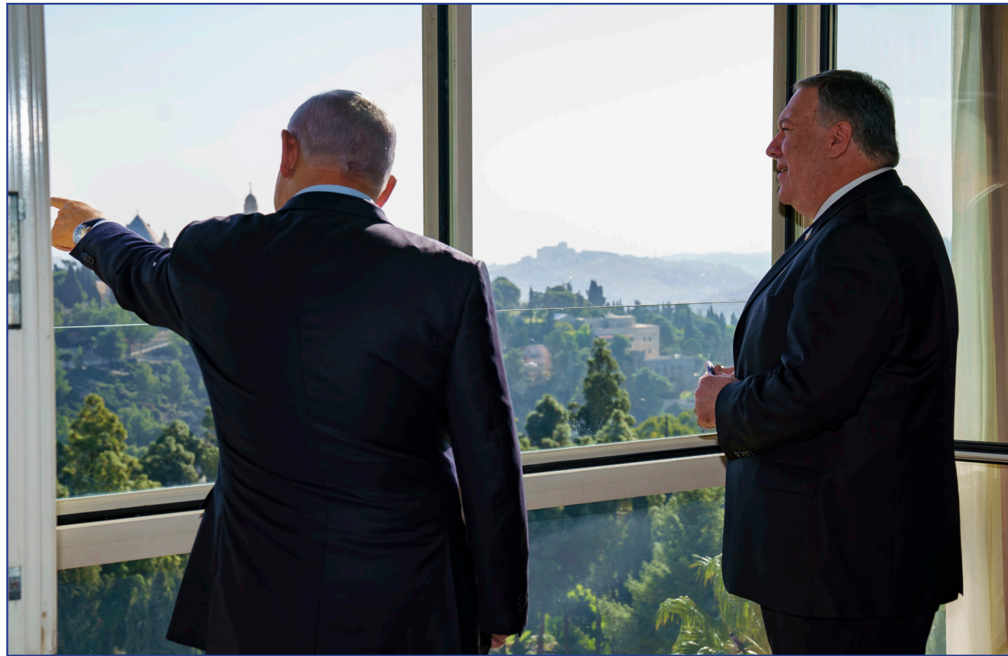
American Secretary of State Pompeo meeting with Israeli PM Netanyahu in November 2020.

by evangelical organizations for projects in West Bank settlements was between $50 million and $65 million – and was growing. The report chronicled the increasingly cozy connection between evangelicals and religious Jews, noting that Trump’s policies done “for the evangelicals” had endeared evangelicals to settlers – of whom around two-thirds are religious. Shared conservative political views on gender relations, LGBTQ rights, minority rights, and other social issues have also drawn the groups into closer cooperation.