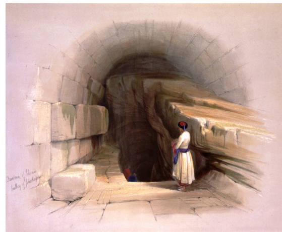
Gihon Spring, David Roberts, Courtesy of the Library of Congress