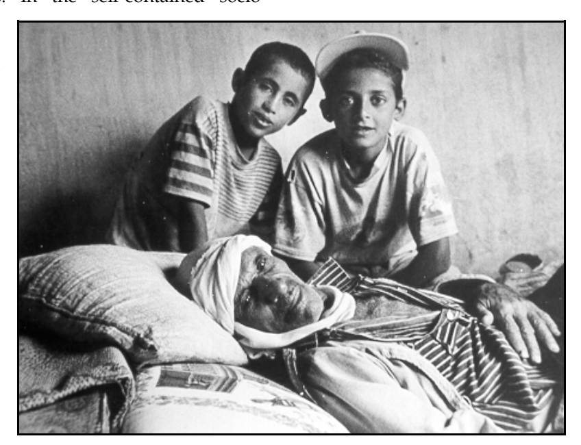
Bedouin boys with their ailing grandfather.

For centuries most Bedouin had resisted Ottoman and later British efforts ensnare them in foreign land registration and taxation schemes. In 1948, the new Zionist state of Israel imposed own self-serving legal system on the Bedouin and demanded written, administrative proof of their land claims. Few of course had it.