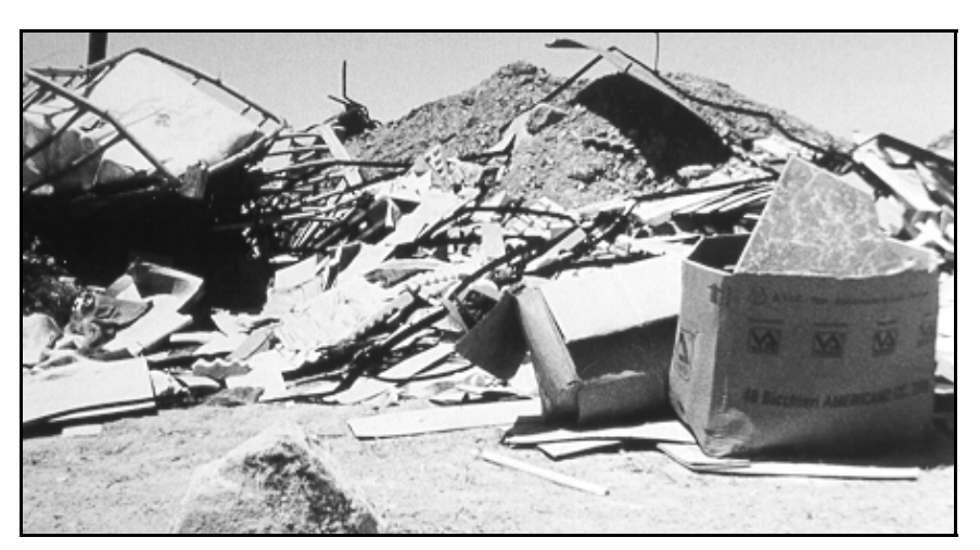
A Bedouin grave site, employed by Israeli Jews as a trash dump.

Israeli tour guides shepherded their charges between