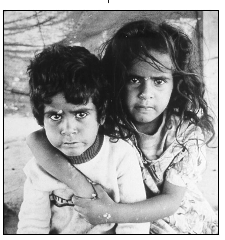
Bedouin children, brother and sister.

Along one part of the Dimona-Be'er Sheva road comes upon dark green snaking, vegetation. It is an odd sight in the desert. At a cursory glance, the green looks—well—healthy. In fact, it is open sewage from the Jewish desert development town Dimona. It is piped underground a few hundred vards from the town itself to where it surfaces into six settling ponds located in the midst of the Bedouin settlement of Huwashle. The people of Al-Huwashle have never been told about the many ill effects the liquid could hold for them.