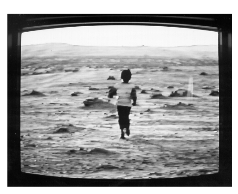
"We grew up in a circle of fear. And now the children face it, too. Go to any child here—even five years old. When he sees a jeep approaching, he panics and starts shouting: 'The Green Patrol is coming.' . . . The Green Patrol keeps scaring them all the time. Whenever they see a kid here, they stop their jeeps and beat them.

One such campsite was particularly disturbing to me. Driving up to the living quarters with a Bedouin interpreter, I noticed a young boy hiding behind a water tank. When he realized I had seen him, he broke off running into the empty desert. I videotaped the scene, one that I will never forget. The interpreter called him back, but to no avail.