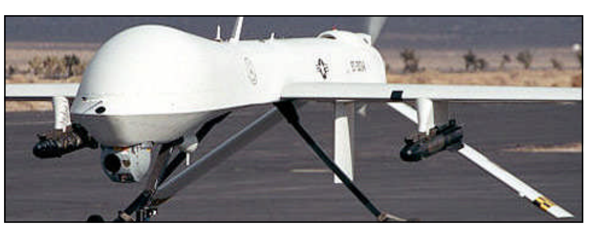
Hellfire Predator, U.S. weapon of choice in Afghanistan.

The concept of "assault drones" using television cameras began